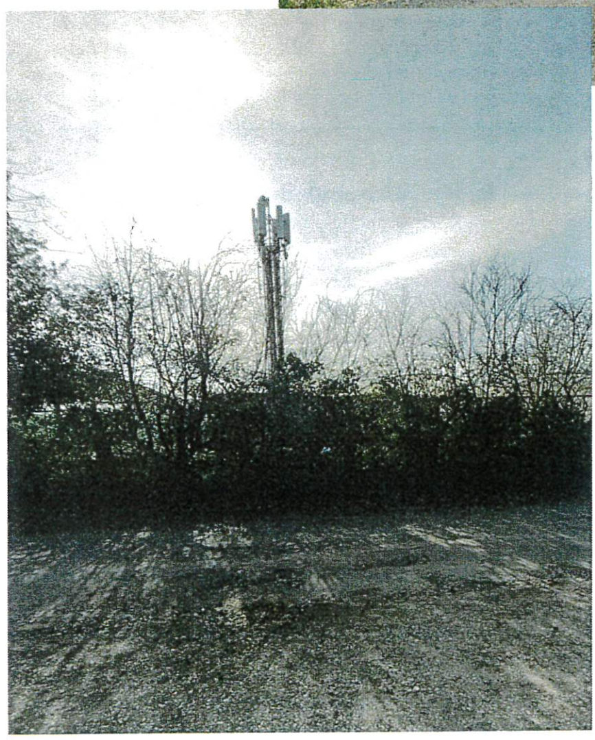
View from the gate of a dwelling