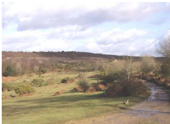
Abbotswell cycle track

The current Public Access map shows a network of 26 Footpaths and 19 Bridleways, around half of these correspond to tracks and paths shown on the Tithe map, There is one cycle track from Abbotswell to Fritham. The possibility of a safe route from the Parish to Fordingbridge, for walkers and cyclists, is currently being considered.