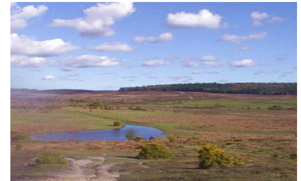
Ogdens from Abbotswell

Stuckton is in the Avon Valley and straddles Ditchend Brook, the dwellings are surrounded by pasture suitable for back-up grazing, and by patches of woodland. The ribbon of mixed houses running downhill from the west of Frogham continues through Stuckton and then northwards towards the B3078 and to Fordingbridge. The dwellings include four semi-detached houses built in 1899, and two early Victorian semi-detached cottages; this style of building is rare within the parish. Stuckton Chapel, a well-proportioned, brick building, is sited by a woodland stream behind the old post office. As in North Gorley, part of the hamlet is outside the National Park boundary and these hamlets are therefore governed by two planning authorities.