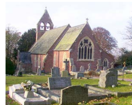
Holy Ascension – Hyde with Ibsley 1850

The Forest has been the abiding influence on the Parish and is the single most important attribute for the majority of its inhabitants. The changes which have taken place in its management have always affected it – they will continue to do so now that the area has become a National Park.