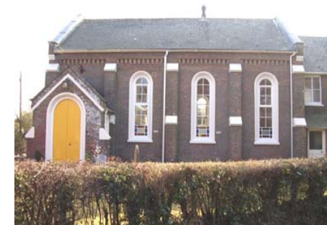
Stuckton Chapel 1886