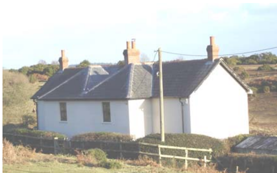
This extension reflects the original cottage.

The traditional tracks and byeways are surfaced with hoggin or gravel and drives that use these materials reflect that tradition. These materials also help to prevent flooding.