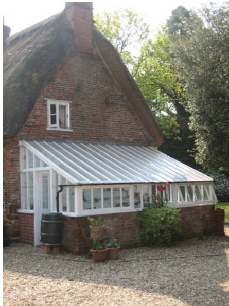
This glass “orangery” complements the cottage

Even an average sized conservatory can have an undesirable impact on a neighbour’s garden or it can isolate a living room from the garden and make the house feel darker. However a well-designed conservatory, compatible with the existing property can provide a sympathetic and appealing form of extension.