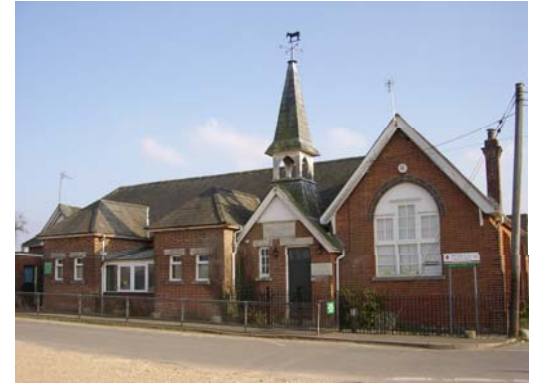
Hyde School 1885

The amenities available to residents fulfil a wide spectrum of needs for personal and community activity.