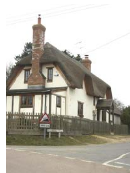
Recently rebuilt cottage

Homes from the 16 th to the 21 st century.