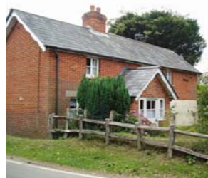
Built 1800 to 1900