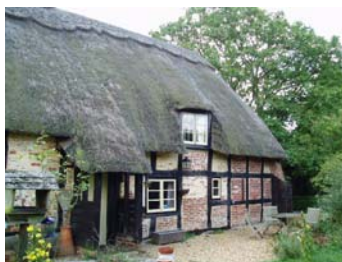
1550's thatched cottage

The variety of the present housing stock is provided by the size and age of the properties and the building materials used.