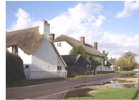
Thatched Cottages at North Gorley

mineral extraction. North Gorley Green is patterned with areas of pond and marsh and parts of it are prone to flooding in winter. The enriched grass on this wetland provides valuable grazing for livestock. Several thatched buildings border the Green, including cottages, a restaurant and The Royal Oak Public House which has evolved from a 16th century hunting lodge. Several dwellings, including a 16th century thatched cottage, regrettably, lie outside the National Park boundary