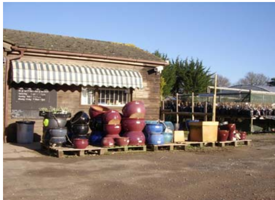
Hyde Village Shop & Garden Centre