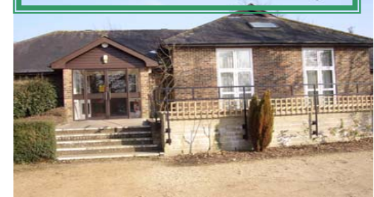
Hyde War Memorial Village Hall

It is considered vital to the ongoing development of the Parish that the opportunities created by a new balance in society is recognised and encouraged so that residents, especially younger ones, can find employment opportunities within the local environment and share the benefits they bring.