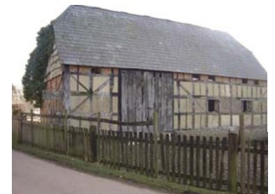
A listed barn