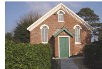
Frogham Chapel 1883