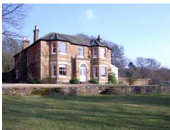
Substantial house 1890's